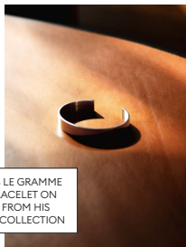
PARENTE'S LE GRAMME SILVER BRACELET ON A TABLE FROM HIS APERTURA COLLECTION