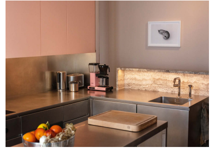
Above: a photograph by Walter Pfeiffer in the kitchen. Below: Château La Martinette Reflets d'Argens rosé, €208 for 12 bottles

MY FAVOURITE APP is Co-Star, an astrology app. In the beginning it was a joke at the studio: now we're